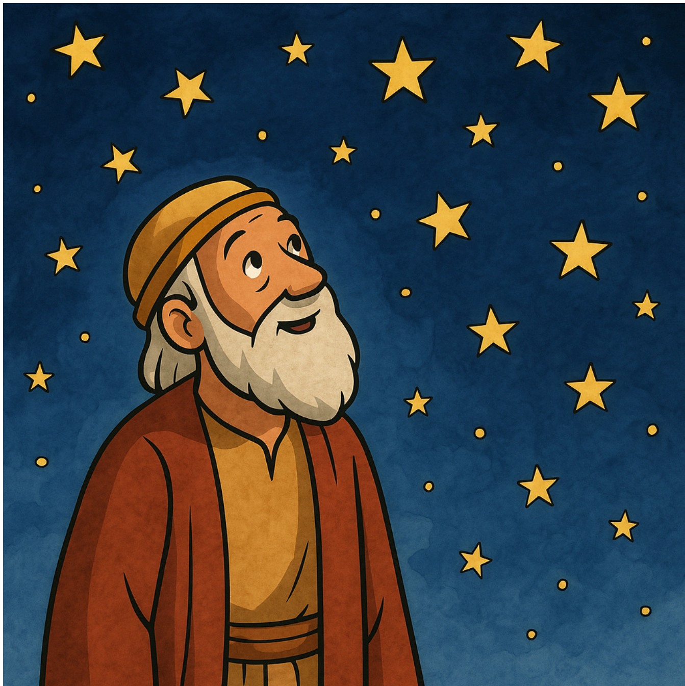
Abraham Looking Up at the Stars