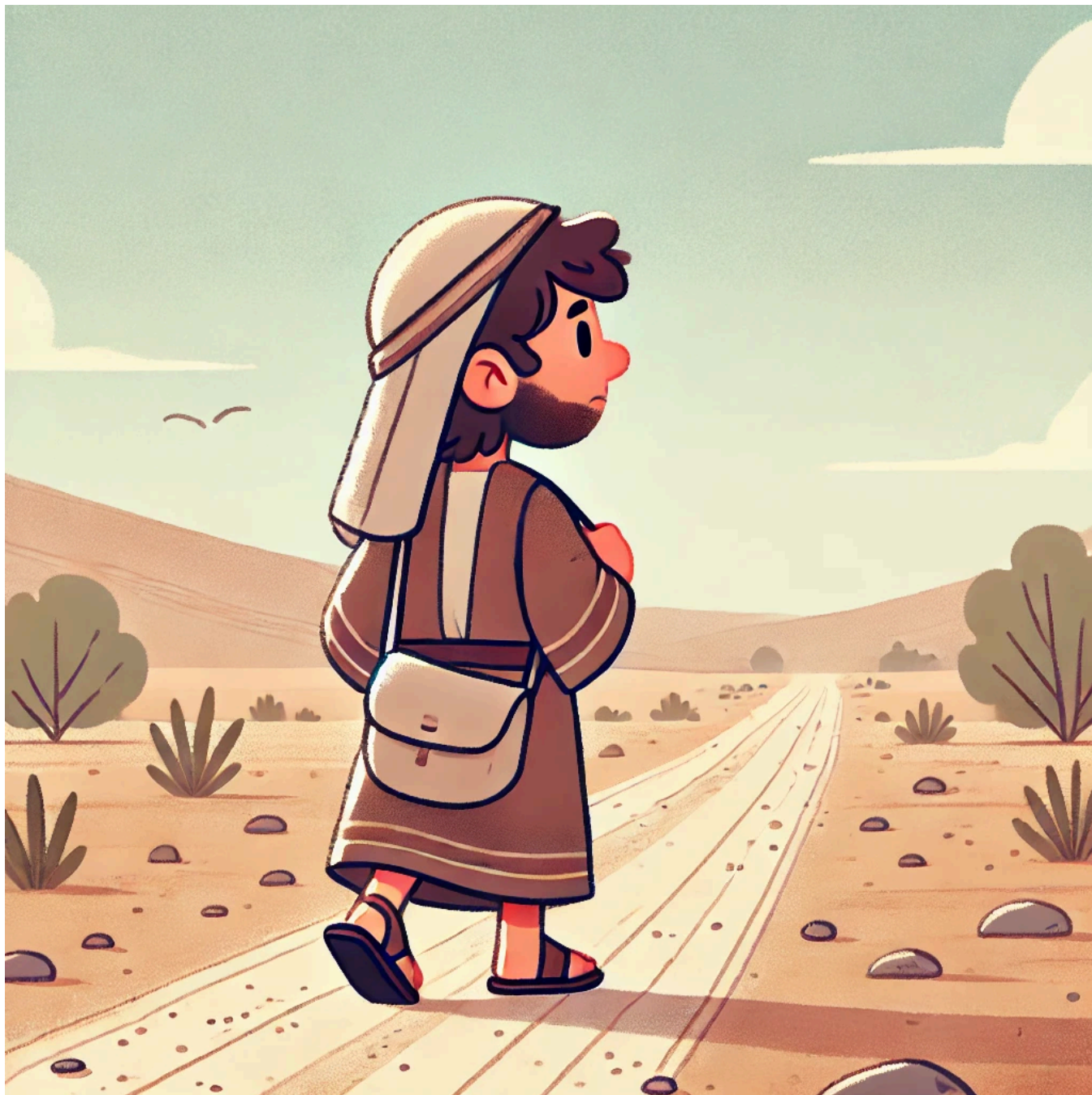
Traveler on a Road